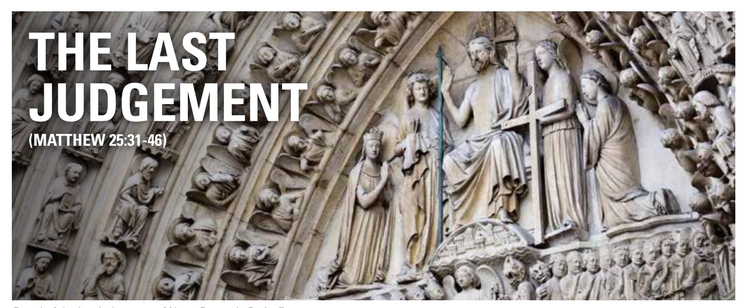
Portal of the last judgement of Notre Dame de Paris, France